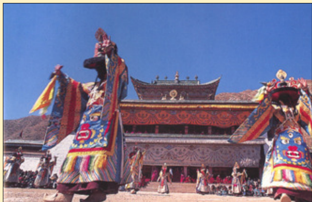
Grand Summons Ceremony at Labrang Monastery, Xiahe

The monastery was built in 1709 by a monk named E'angzongzhe, who was to become the first of the monastery's Living Buddhas (Jiemuyang). At its height, 6000 monks lived and prayed in the temple. Today there are around 2000 monks, mainly from Qinghai, Gansu, Sichuan, and Inner Mongolia. In total the monastery holds over 60,000 Tibetan sutras and thousands of rare Buddhist