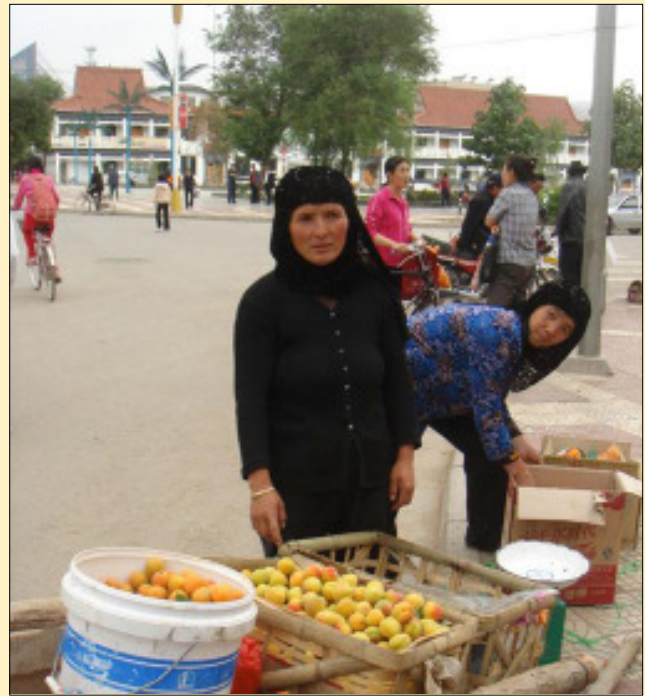
A Salar muslim woman selling fruits, Xunhua

The temple is most sacred due to the personages who have graced it with their presence. It was originally built upon the birthplace of the founder of the Gelukpa Sect (Yellow Hat) of Tibetan Buddhism, Tsong Khapa. Two of his disciples went on to become famous in the Buddhist world, one becoming the fourteenth Dalai Lama, the other the tenth Panchan Lama.