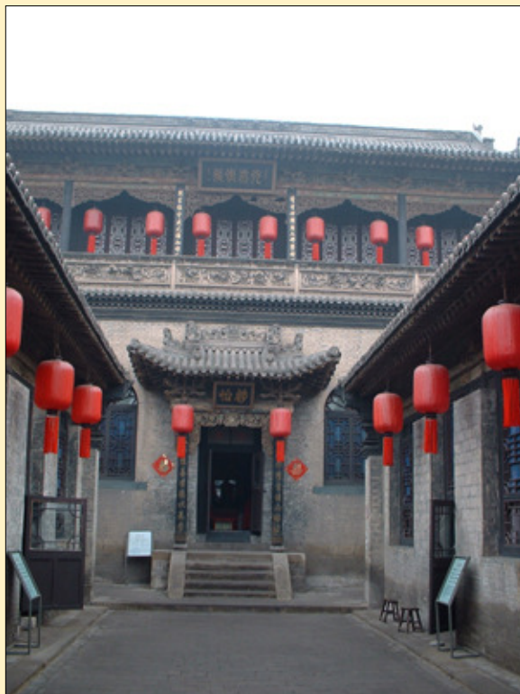
Qiao Family Compound, near Pingyao

You will be given a half-day guided tour of Pingyao Old Town , a walled city with a 2000-year history and many old Ming and Qing dynasty houses, compounds, temples, and defensive structures. Pingyao has the best preserved