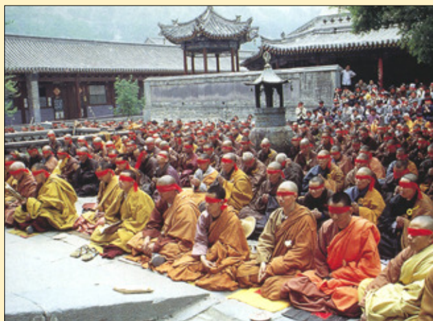
A Buddhist ceremony in a monastery of Wutaishan