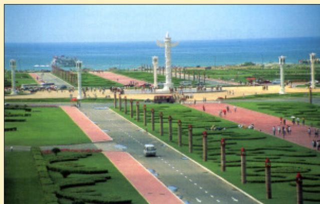
Xinghai Square by the ocean, Dalian

Stop by the Pagoda of Buddhist Ashes , a thirteen-storey, fifty-meter-high (164 feet) hollow brick structure built in 1044 AD during the Liao Dynasty. It has survived many earthquakes. Also visit the Shenyang Steam Locomotive Exhibition Park , where sixteen antiquated steam trains