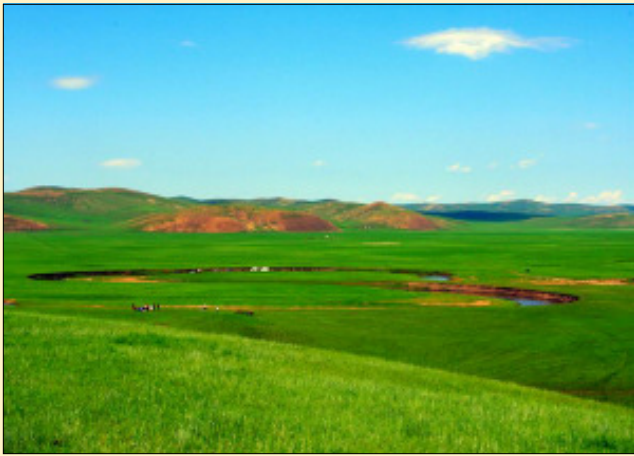
Hulunbeier grassland, Inner Mongolia

“Zhangzिसong”, and the very interesting Museum of Ewenke Ethnic Culture .