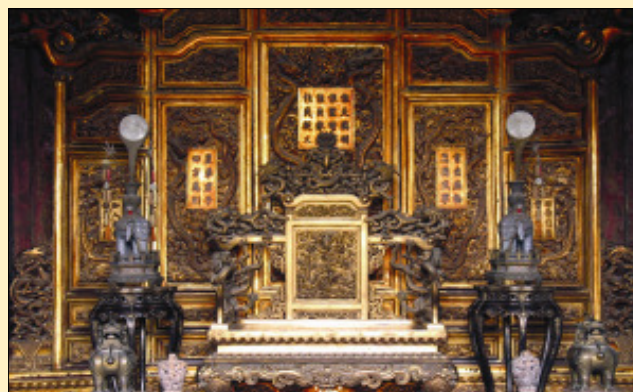
The Throne in Shenyang Imperial Palace Museum

from America, Japan, Soviet, Belgium, Czechoslovakia, Poland, Germany, and China are on display.