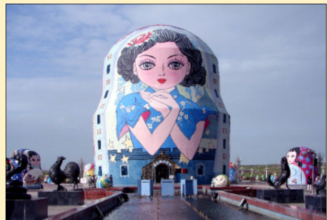
New Chinese-Russian style monument in a Manzhouli public square, Hulunbeier

In the afternoon, visit a Japanese Tunnel built during their occupation in the Second World War, the Hailaer Forest Park for an endemic local species of pine tree