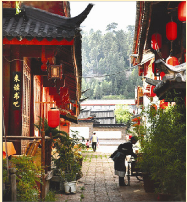
A small street in the old town of Lijiang

Enjoy the unparalleled dramatic scenery with an exhilarating hike along the gorge trails. Spend the night in the quaint village of Walnut Garden .