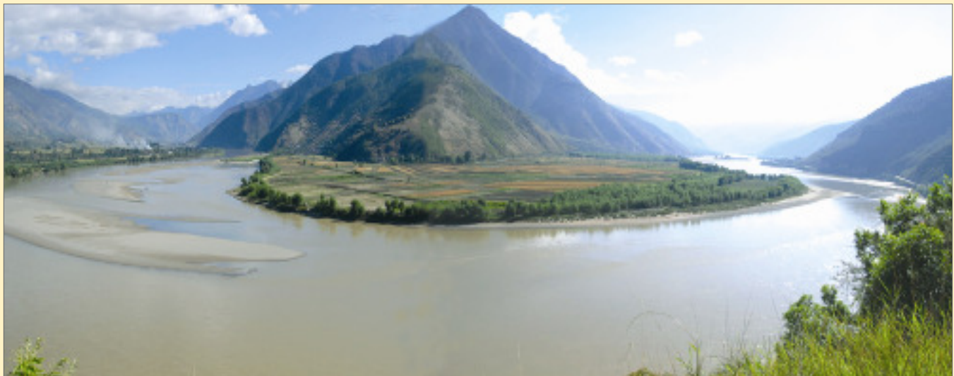
A 180 degree turn of the Yangzi River at Shigu Town near Lijiang

After a rest, explore the Old Town of Lijiang with wonderful strolls through a maze of cobble stone streets flanked by characteristic Naxi architecture. Finish the day at Black Dragon Pool Park and its informative Naxi