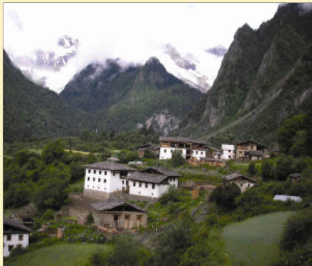
Yubeng Village and Yongming Glacier on Meili Snow Mountain, Deqin

The main attraction in Deqin area is the Meili Snow Mountain (Kawagebo in Tibetan), to the west of town. Soaring 6,740 meters (22,107 feet) into the sky, Meili is the tallest mountain in Yunnan and has never been climbed despite several fatal attempts. The Tibetan