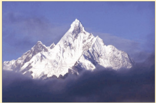
The Goddess Peak of Meili Snow Mountain in Deqin

people regard Meili as one of its most sacred holy mountains, each fall thousands come from afar to celebrate and to worship the sacred mountain.