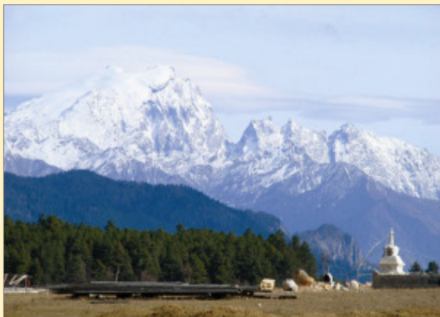
Haba Snow Mountain near Zhongdian, Yunnan

Next, drive along the banks of the Yangzi to reach Qiaotou village. We bid farewell to our vehicle here and begin a dramatic hiking experience into the magnificent Tiger Leaping Gorge of the Yangzi River. Here, the turbulent Yangzi, the third longest river in the world, forces its way along the deep canyon, roaring across huge boulders and cutting through the twin Snow Mountains of Yulong and Haba.