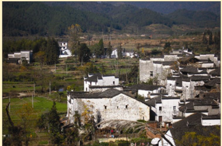
A small village in Wuyuan County, Jiangxi Province

Transfer to the airport and board your homebound flight. Arrive in North America on the same day. <B>