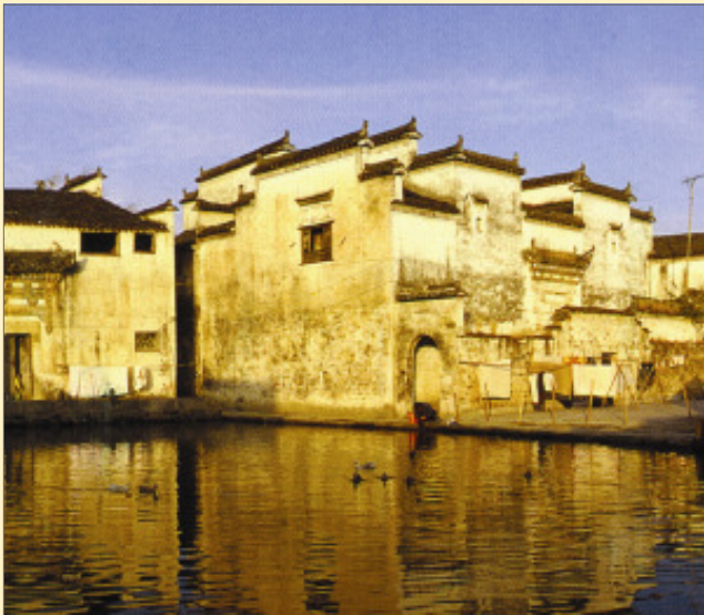
Village houses in Shexian, Huangshan

and visit the village of Yingbeigou . Transfer to the airport in late afternoon and fly to Huangshan. Met and transfer to your hotel in Tunxi.