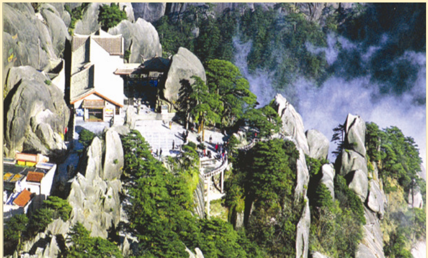
Yupinglou (Jade Screen Pavillion) Vista on Yellow Mountain

Arise early before dawn to see the famous North Sea Sunrise , a dramatic view across a sea of cloud and fog weather permitting. After breakfast in the hotel, we hike to Yungu (Cloud Valley) and take a cable car ride back