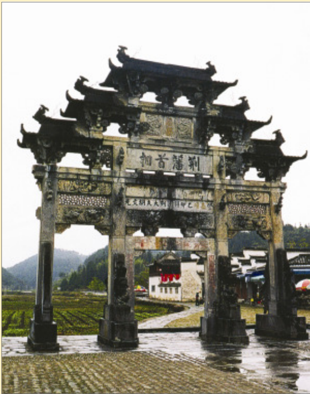
The memorial arch of Xidi Village, Huangshan

down the mountain. Travel by private vehicle with guide to Xidi Village.