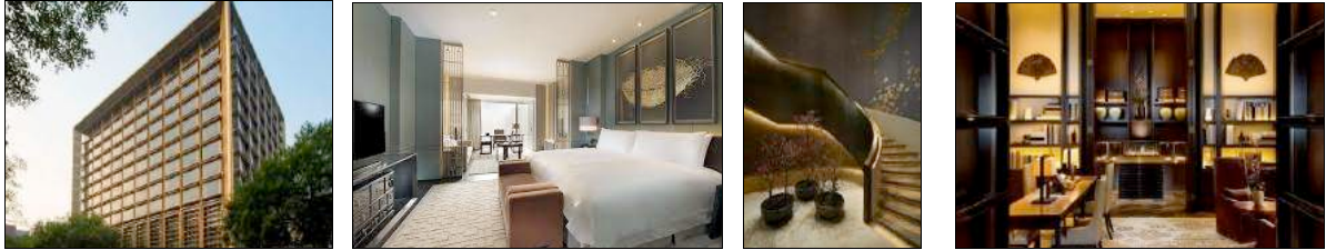
Waldorf Astoria Beijing