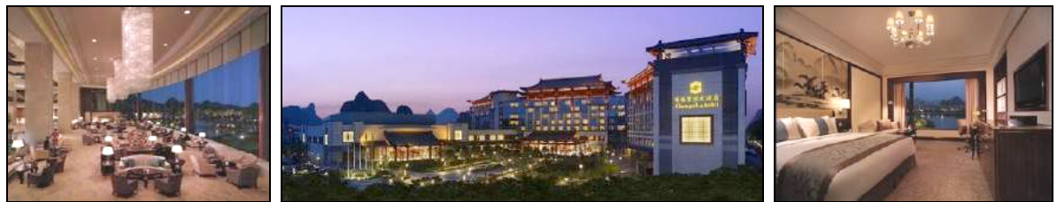
Shangri-la Hotel Guilin