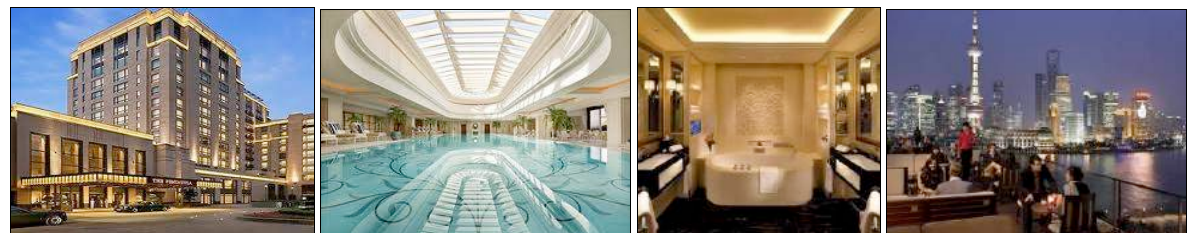
The Peninsula Shanghai