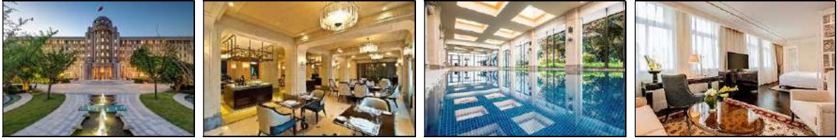
Sofitel Legend Peoples Grand Hotel Xi'an