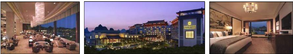
Shangri-la Hotel Guilin