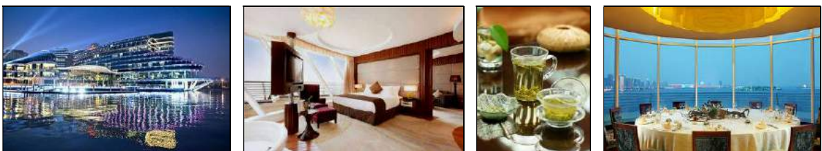
Crowne Plaza Suzhou