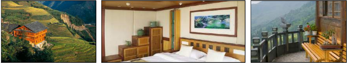
Li'an Lodge Longsheng