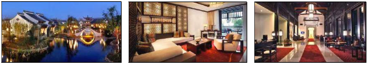
Banyan Tree Hangzhou