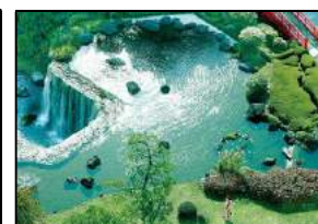
Hotel New Otani Main Tower Tokyo