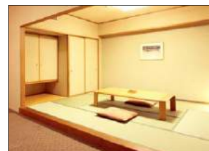
Yomoto Fujiya Hotel Hakone