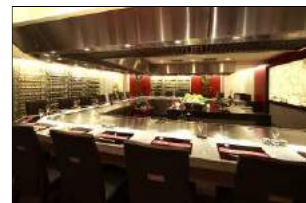
Hotel Nikko Princess Kyoto