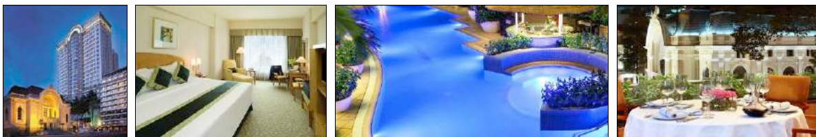
Caravelle Hotel Saigon