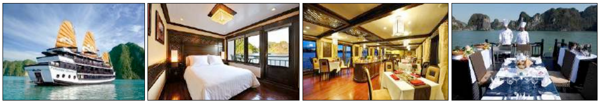
Paradise Luxury Cruise Halong Bay