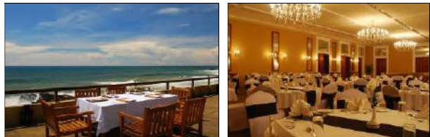
Jetwing Lighthouse Hotel Galle