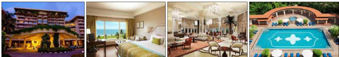
Taj Samudra Hotel Colombo