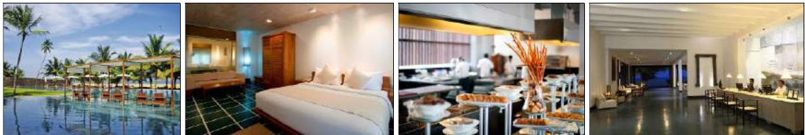
Jetwing Blue Negombo