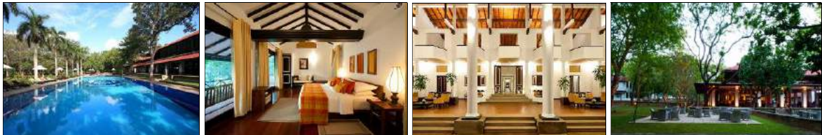
Cinnamon Lodge Hanarana