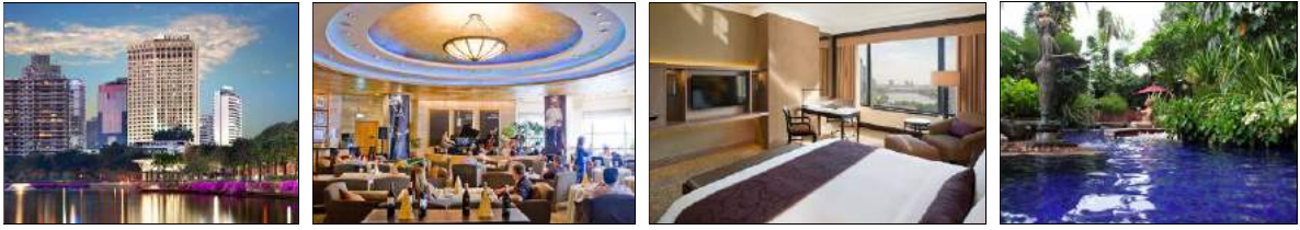
Sheraton Grande Sukhumvit Bangkok