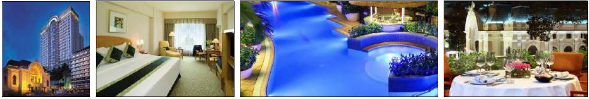
Caravelle Hotel Saigon