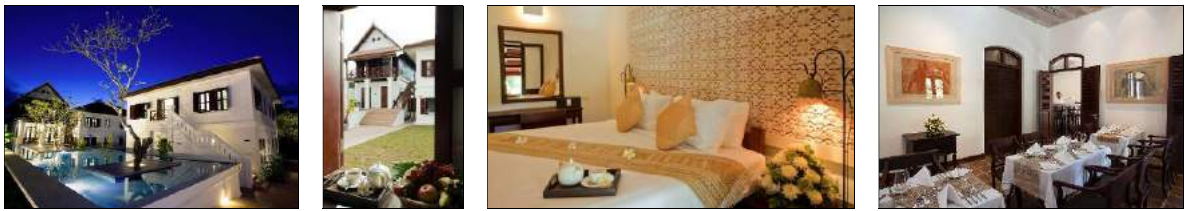
Victoria Xiangthong Palace Luang Prabang