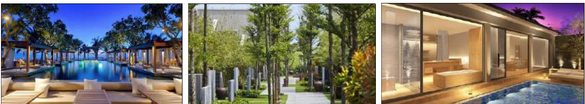
Naman Retreat Da Nang