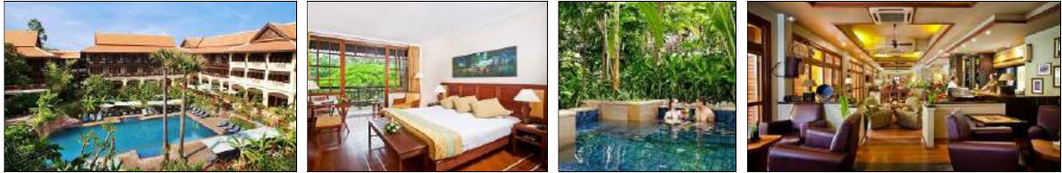
Victoria Angkor Resort & Spa Siem Reap