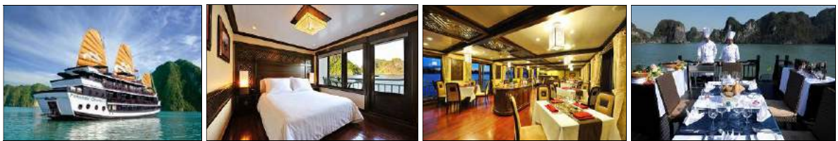
Paradise Luxury Cruise Halong Bay