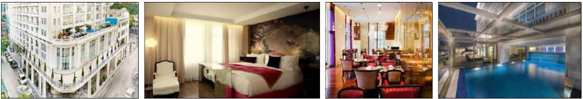
Hotel de l'Opera Hanoi