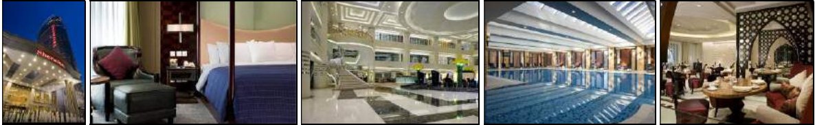
Sheraton Urumqi Hotel