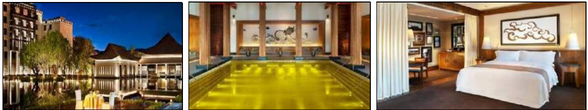
The St. Regis Lhasa Resort