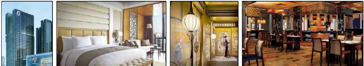
The Ritz Carlton Chengdu