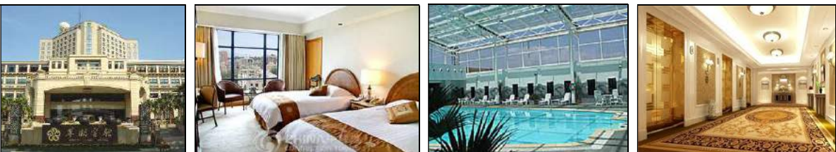
Green Lake Hotel Kunming