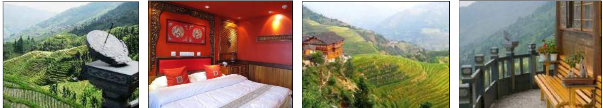
Li'An Lodge Longsheng