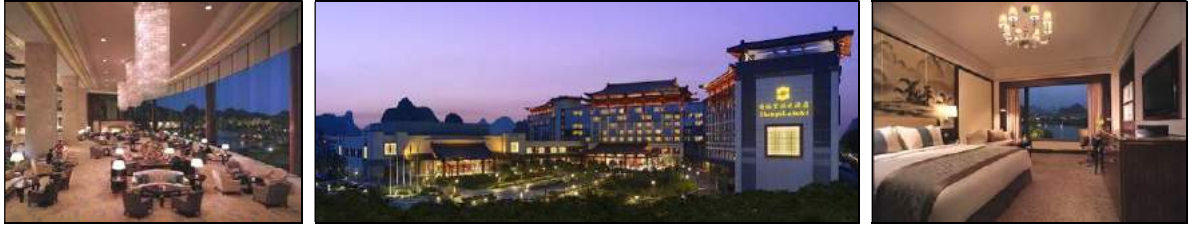
Shangri-la Hotel Guilin