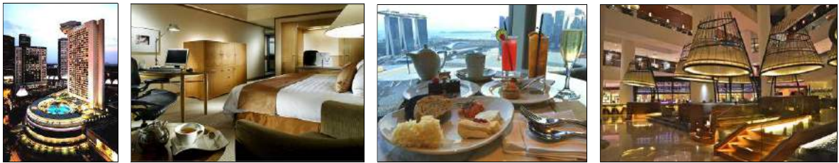
Pan Pacific Hotel Singapore