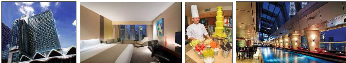
Traders Hotel Kuala Lumpur