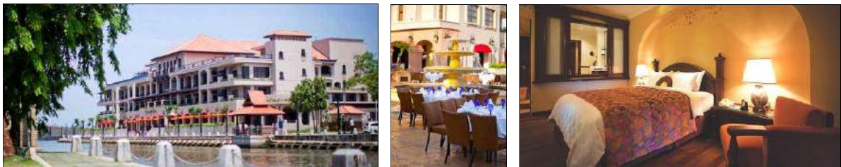
Casa Del Rio Melaka