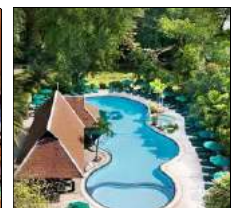
Royal Orchid Sheraton Hotel & Tower Bangkok