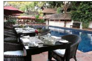
Tamarind Village Chiang Mai