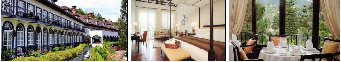
Cameron Highlands Resort