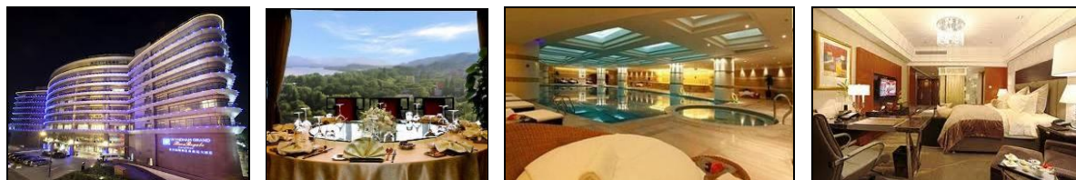
Wyndham Grand Plaza Royale West Lake Hotel