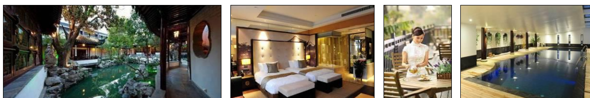
Scholars Hotel Suzhou Pingjiang Fu