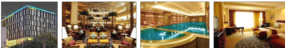
Grand Central Hotel Shanghai