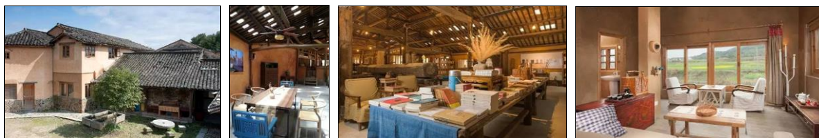
Huangshan Pig's Inn Laoyoufang