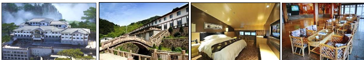
Xihai Hotel Huangshan