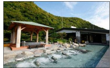
Tensei En Ryokan Hakone