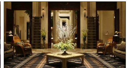
Hotel Nikko Kanazawa