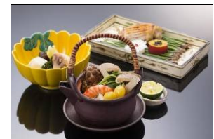
Hana Murasaki Ryokan Kaga