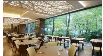
Keio Plaza Hotel Tokyo