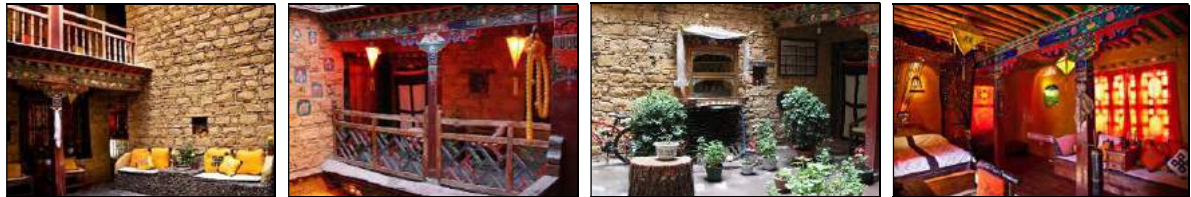
Shambala Palace Hotel Lhasa