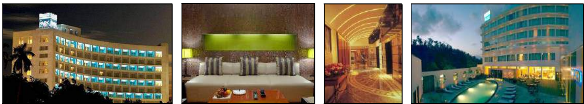
The Park Hotel New Delhi