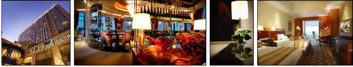
Park Plaza Beijing Wangfujing