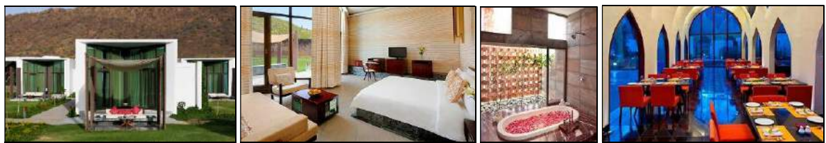
Lebua Lodge at Amer, Jaipur