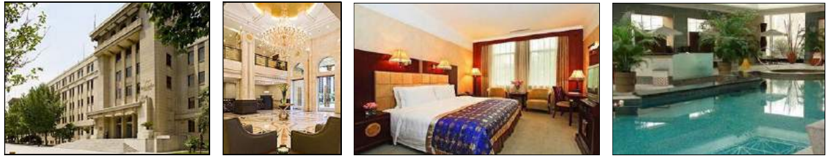
Grand Mercure Xi'an Renmin Square