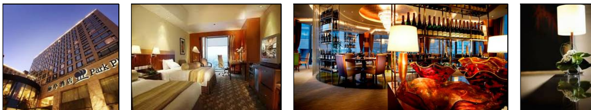
Park Plaza Beijing Wangfujing