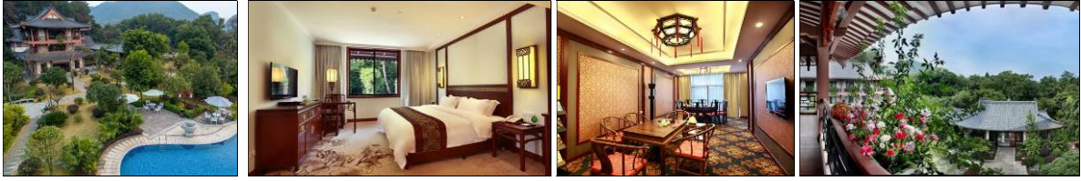
Guilinyi Royal Palace Hotel