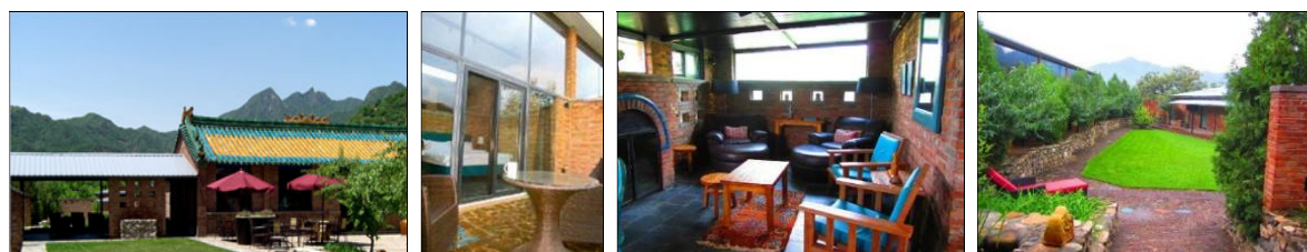
Brickyard Eco Retreat Mutianyu