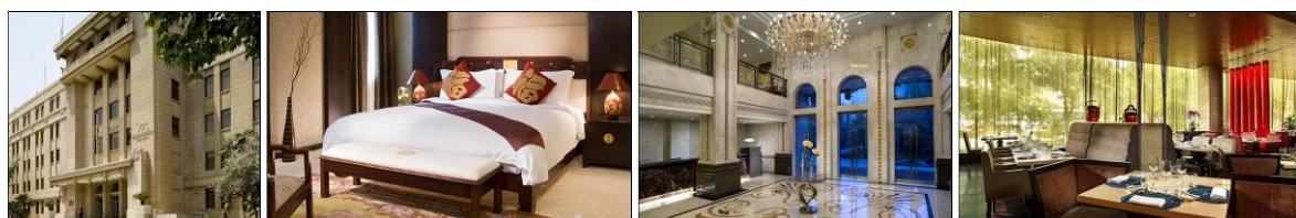
Grand Mercure Xi'an Hotel on Renmin Square