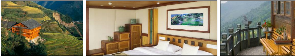
Li'An Lodge Longsheng