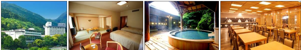
Yumoto Fujiya Hotel Hakone