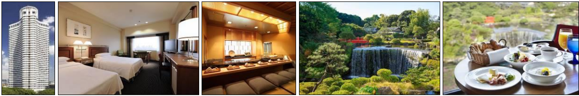
Hotel New Otani, Garden Tower Tokyo