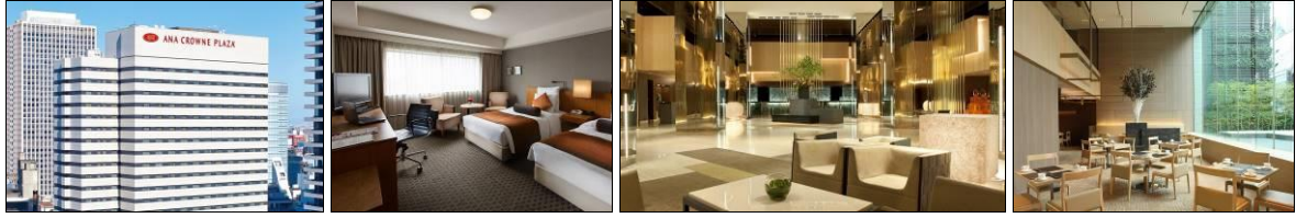
ANA Crowne Plaza Osaka